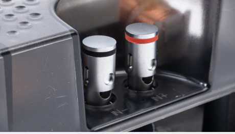
Nickel-plated, spring loaded binding posts feature a larger wire hole to accept highergauge wire or banana plugs.

Rear Component Shielding protects internal parts from debris. The polycarbonate material creates an installation that will not warp. Flat covers also make it easy to lie speakers down during the installation process without tipping.